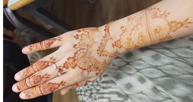
Sixth Form students celebrating Cultural Week earlier this year

happening with regards to diversity and inclusion.